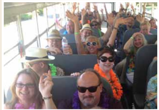
Guests aboard one of the "School of Rum" bar tour buses, Tiki Kon 2013