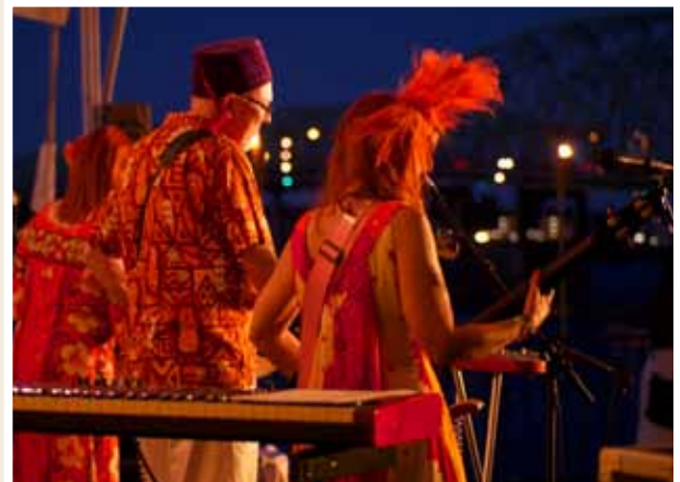
The Ding Dong Devils from Los Angeles perform on the River Deck at the Red Lion at the Quay, Tiki Kon 2013.

The weekend finale is an all-day VIP tour of Portland's most amazing home and commercial tiki bars. One hundred guests, colorfully attired, climb aboard big yellow "School of Rum" buses for an exciting excursion to the watering holes and hideaways of Portland's most passionate tiki and lounge culture aficionados. Tour includes buffet brunch, lunch, and expertly crafted cocktails at every stop.